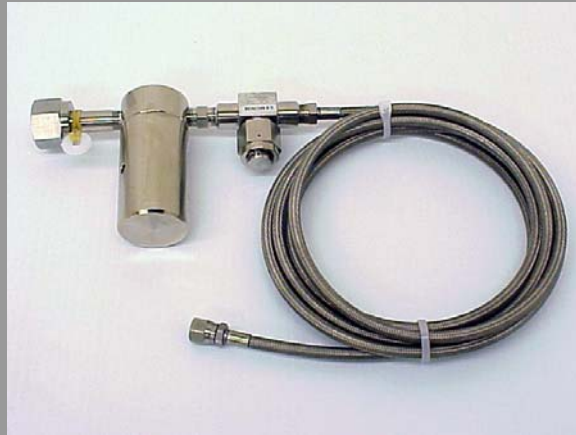
# 8784 LCO 2 Filter Housing with # 8760-34 CGA - 320 S.S. Coupler & # 8770-33 High Pressure Hose (10ft)