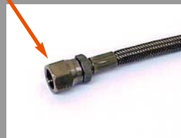
Connector to SAMDRI®