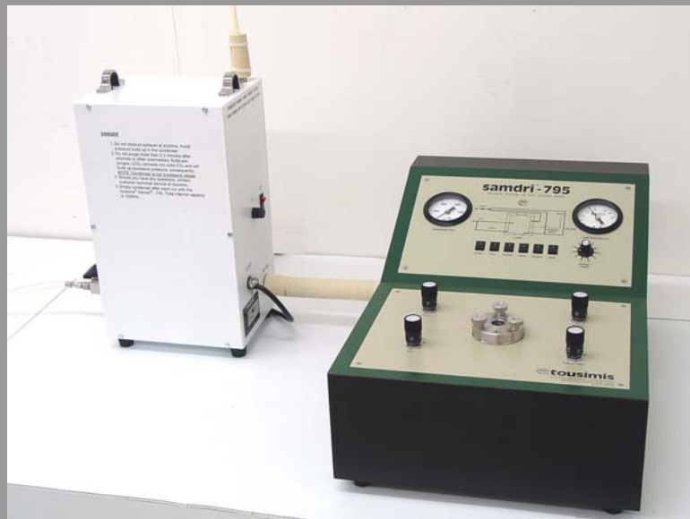
Optional SOTER™ Condenser Shown Connected to SAMDRI®-795

SOTER™ Condenser capable of quietly separating alcohol(s) from CO 2 exhaust discharge of your SAMDRI® chamber. Standard 120V grounded power source required. Comes complete with 10' static free 1/4" ID exhaust line, insulated exhaust connect from SAMDRI®, and clear drain line tubing.